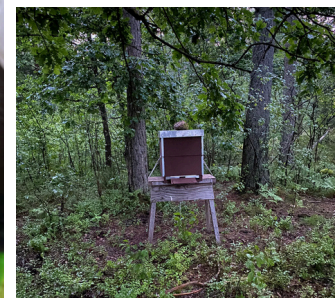
The swarm of bees from the tree.

We anticipate these thriving hives will be returned to the farm and settled into our dedicated beekeeping area by the end of the summer. We're looking forward to welcoming them home!